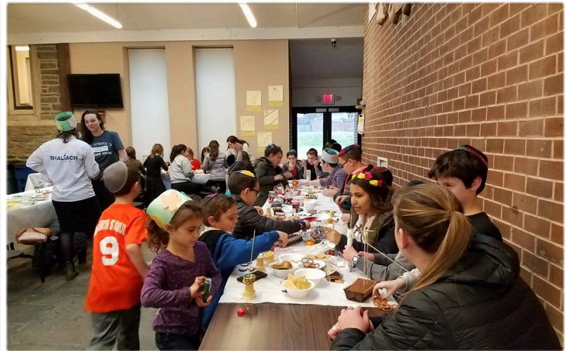
Chanichim and Madrichim at the Tu B'Shvat event.

Our mission is to inspire and empower Jewish Youth with a deep commitment to the Jewish people, the Land of Israel, and the Torah through a wide variety of informal and experiential educational programs.